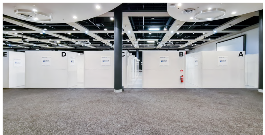
Protecta Screen and Vinyl flooring used to create testing booths and temporary flooring.

HD Construction contacted Protecta Group on a Saturday morning, requiring a temporary hoarding and flooring to convert the sports arena into a 70-cubicle vaccination and testing centre by the Monday morning. The system needed to be strong and stable with so many people moving through the centre as well as easy to clean and sanitise.