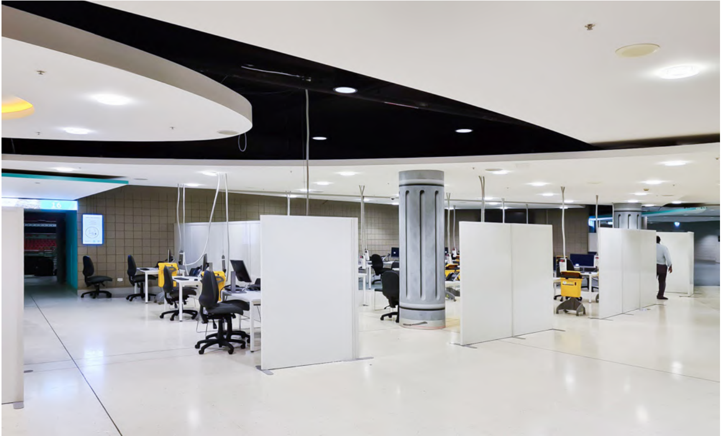
Protecta Screen free-standing system used to create vaccination stations.