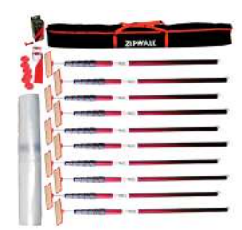
ZipWall® Super-Tall Kit (ZST10)

To view all eligible items in the ZipWall range, scan or click the QR code to learn more