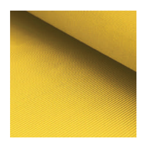
Protecta Rubber Runner (PRR110-Y, PRR110-B)