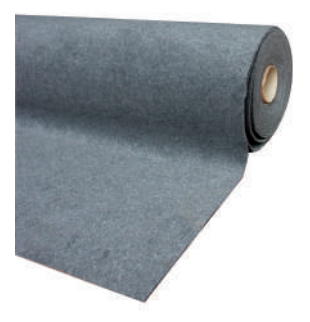
Protecta Carpet Industrial (PC1222)