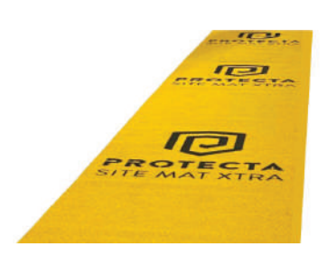
Protecta Site Mat Xtra (PSMX1210-Y)