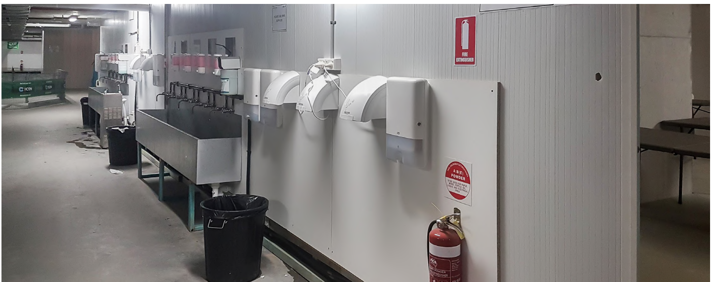
The smart pre-finished panels are made from durable and weatherproof PVC for optimised hygiene.