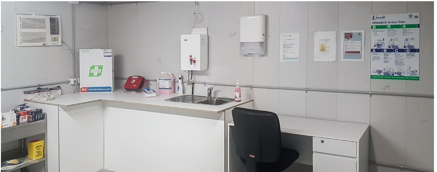
FastWall used to create specialised rooms onsite.