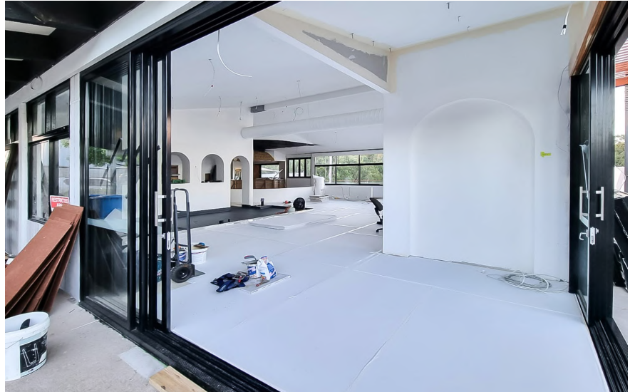
High-impact rated Bubble Board means your floors will be protected from damage and expensive repairs.

Once the Bubble Board was in place, it not only protected the vinyl, but also provided a solid and slip resistant surface, able to withstand heavy traffic, while the rest of the project was completed.