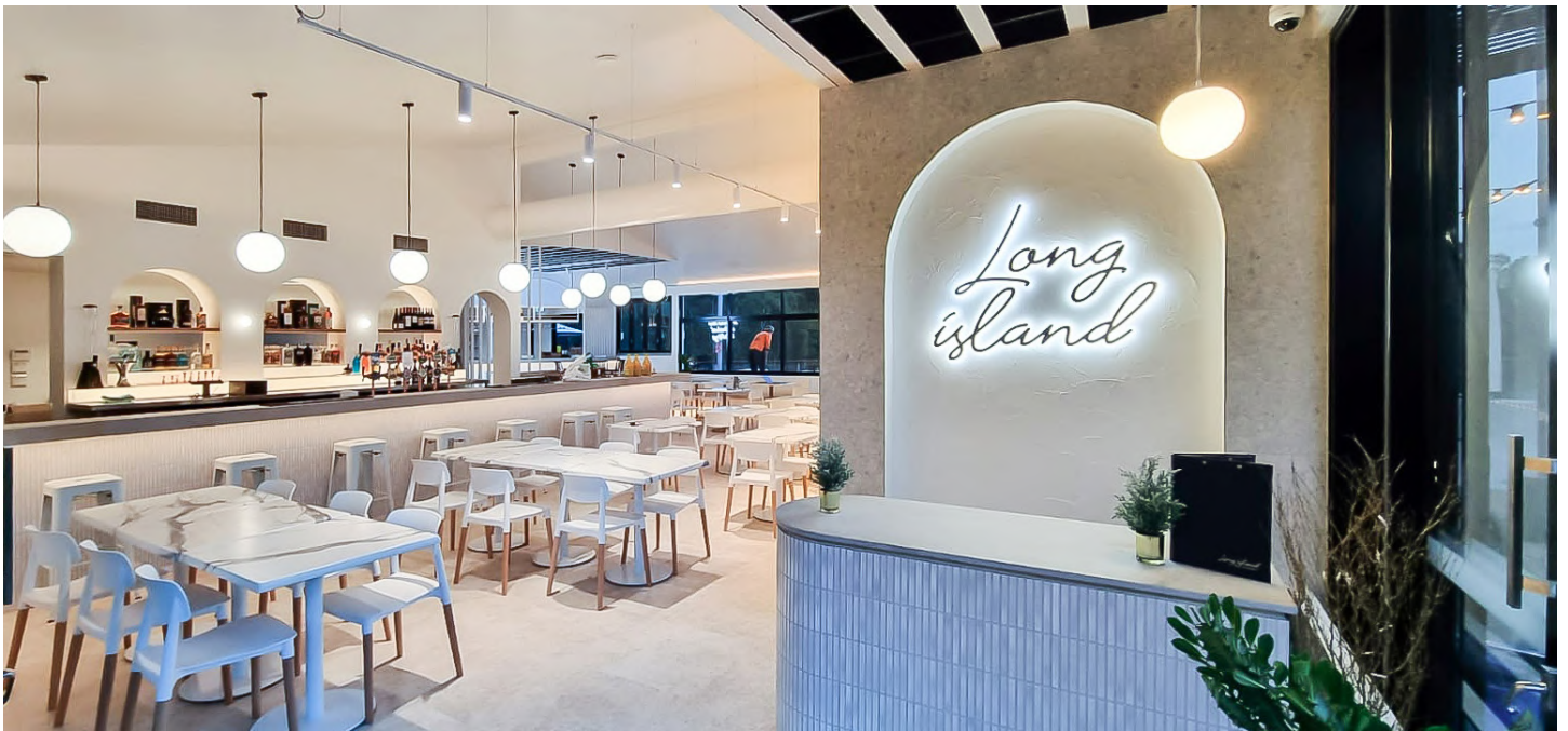
Protected floors means less delays and happier clients.

When the protection was removed at the conclusion of the project, not only was the new flooring preserved in pristine condition, but the Bubble Board could also be reused on their next project. By using our Bubble Board, Visage Building Group were able to save time and money, by ensuring that there was no need to clean or repair damaged flooring at the end of the project.