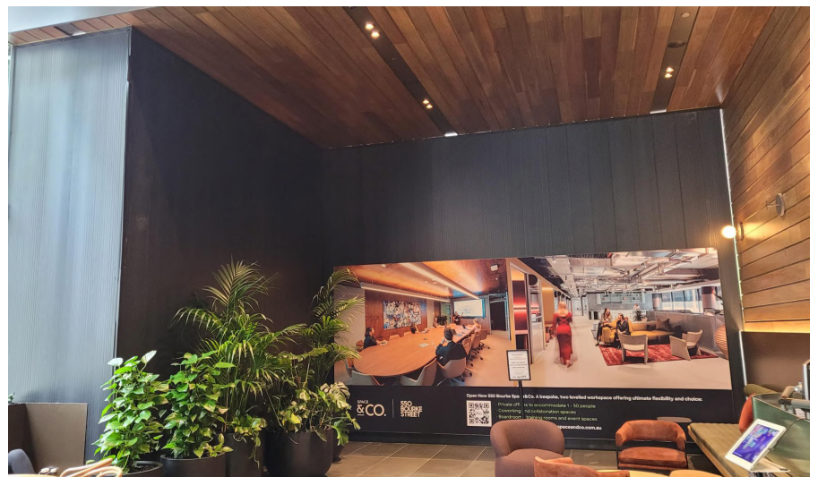
Black FastWall blends with recently renovated lobby area.

To ensure a safe environment for visitors and minimise any construction-related inconvenience, Shape faced the challenge of finding a suitable hoarding system to separate the construction area from the lobby. The task was further complicated by the building's high ceiling of nearly 5 metres, requiring an easy-to-install solution that would ensure a professional appearance and blend seamlessly with the sleek furnishings in the lobby. The hoarding system also needed to be able to be relocated to a different area of the lobby after a few months.