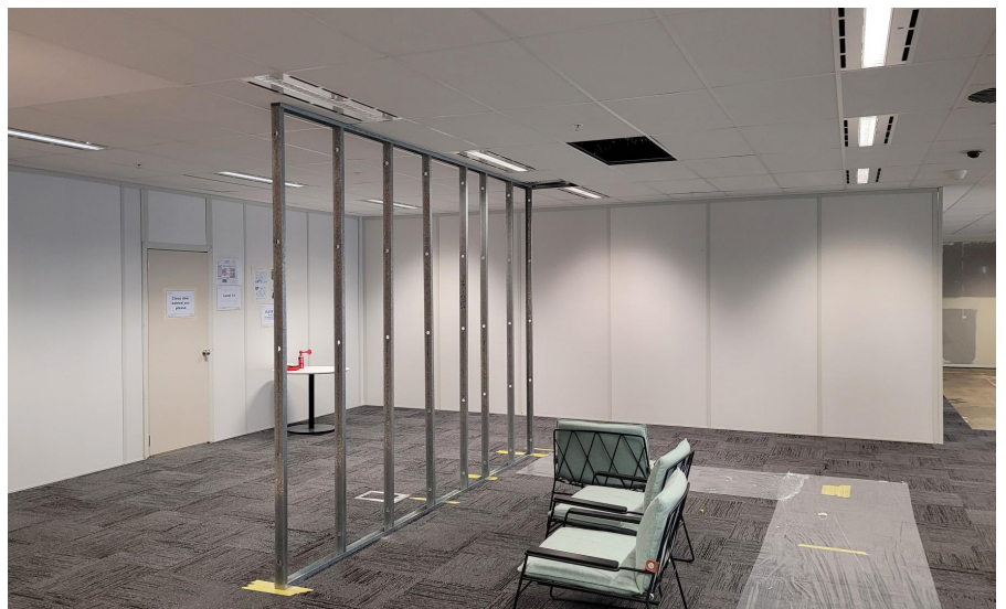
Enviro Wall® used to separate work zones for fitout works.

Hunter Mason needed a hoarding to protect office areas from dust and noise while undergoing an office fitout for Optus in the 727 Collins Street building. The project included blocking off the expansive building atrium within a short period of one week.